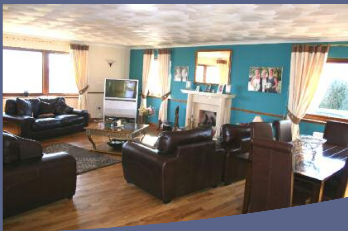
Invercloy House, Brodick, Isle of Arran KA27 8AJ