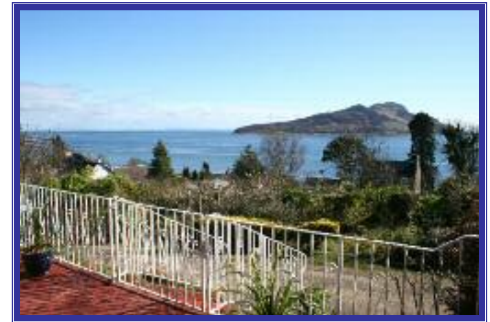
View from Lohengrin

Spacious hall with oak flooring and feature LED 'starlight' downlighting incorporated in the ceiling. Built in cupboard with oak doors and access to all rooms.