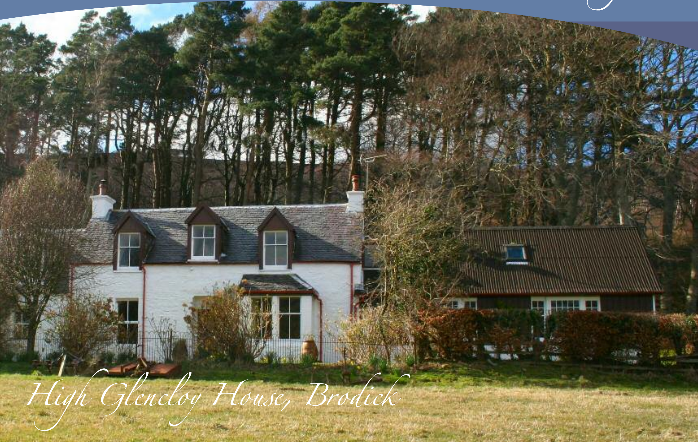
High Glencloy House, Brodick