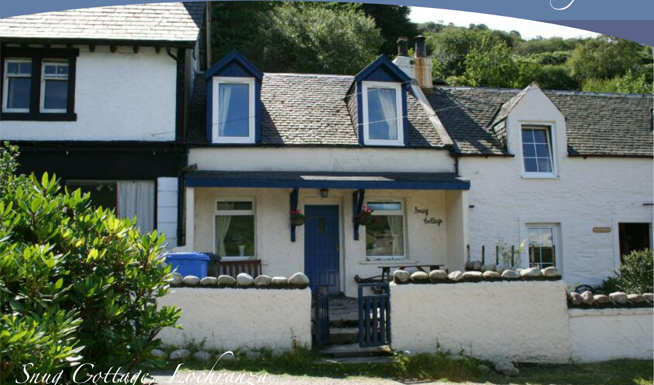
Snug Cottage, Lochranza