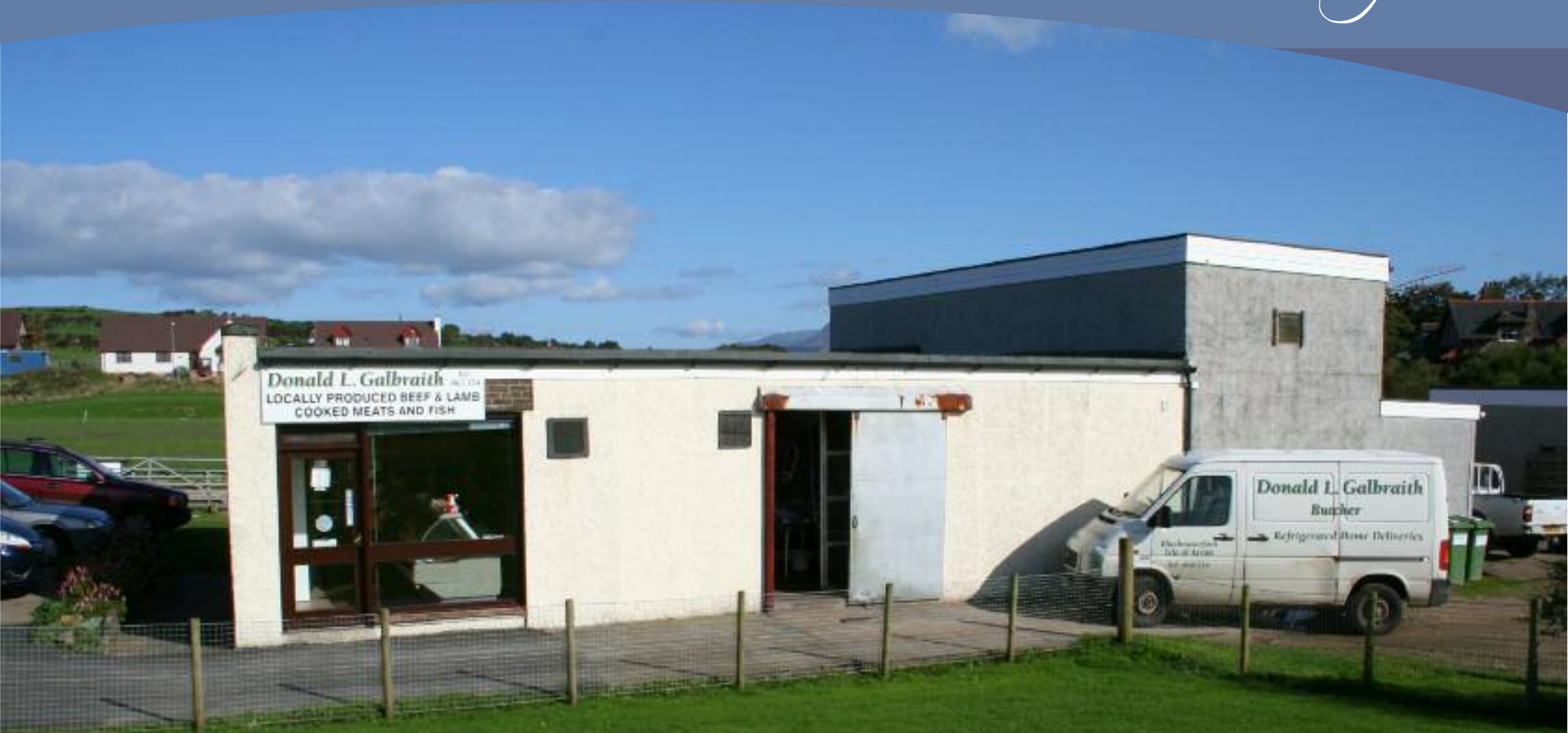
Galbraiths Butchers, Blackwaterfoot