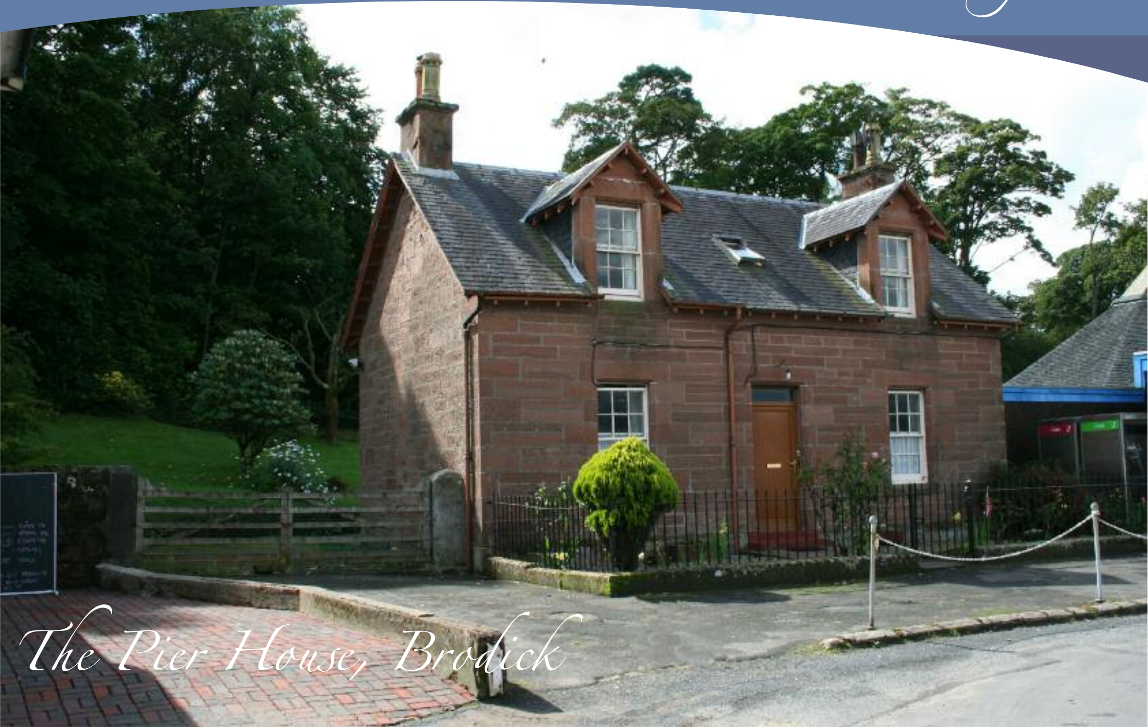
The Pier House, Brodick