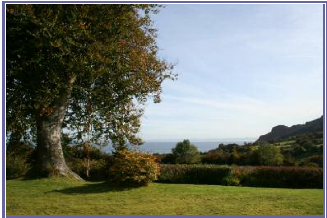
View from Whitehill

PLEASE NOTE THAT ALL VIEWINGS ARE STRICTLY BY APPOINTMENT ONLY The vendor or his agent reserves the right to accept any offer at any time without prior notice being given. However the agent will, so far as is reasonably possible, advise all prospective purchasers who have notified the agents of their intention to offer, of any closing date and time which may be set. These particulars are believed to be correct but their accuracy is not guaranteed and they should not form or constitute any part of any contract.