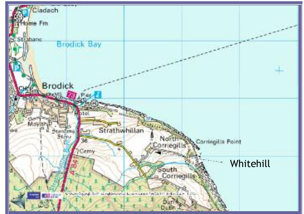
Location of Whitehill

If you would like us to collect you at the pier we will be pleased to do so and to transport you to and from the property.