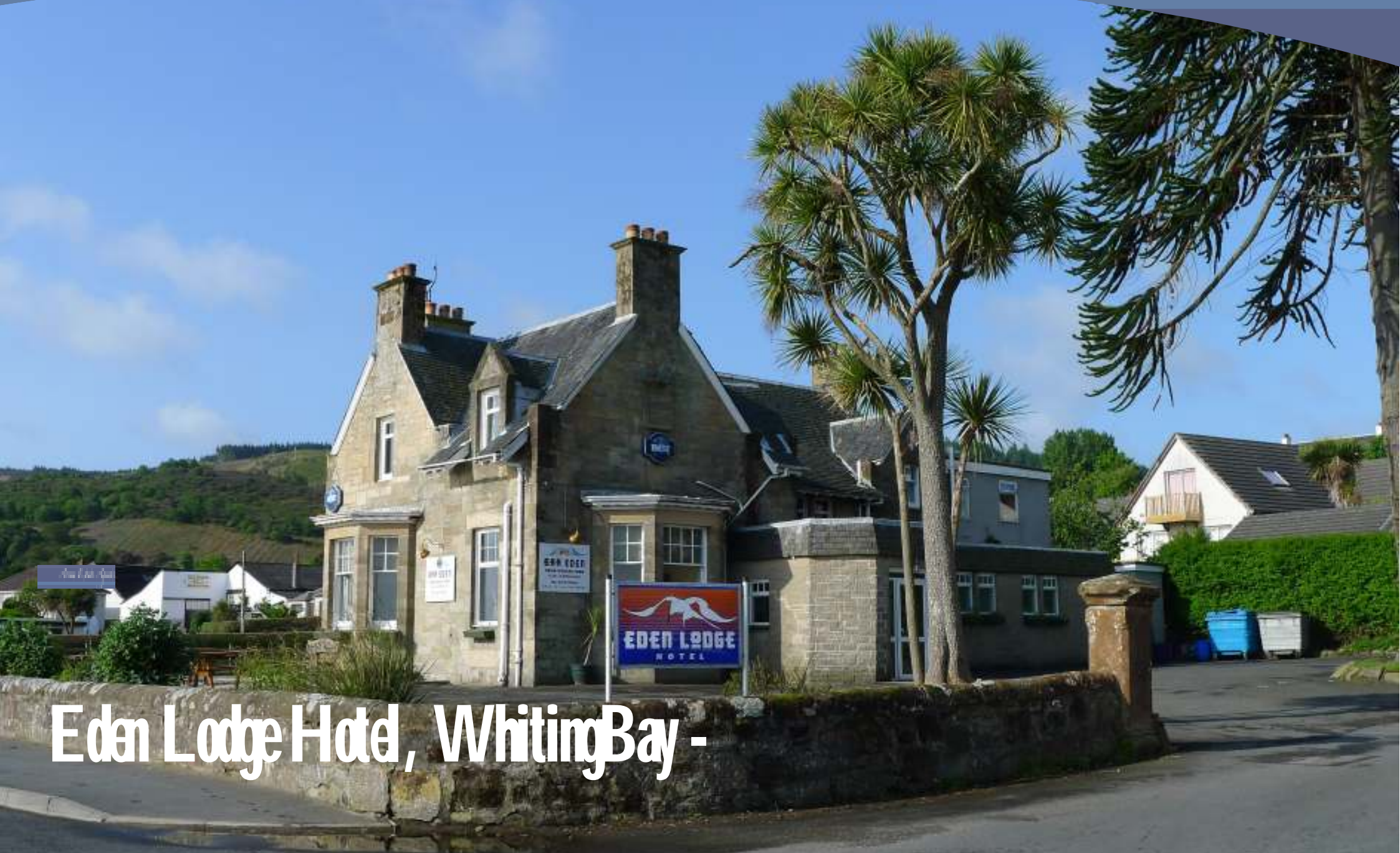
Eden Lodge Hotel, Whiting Bay -