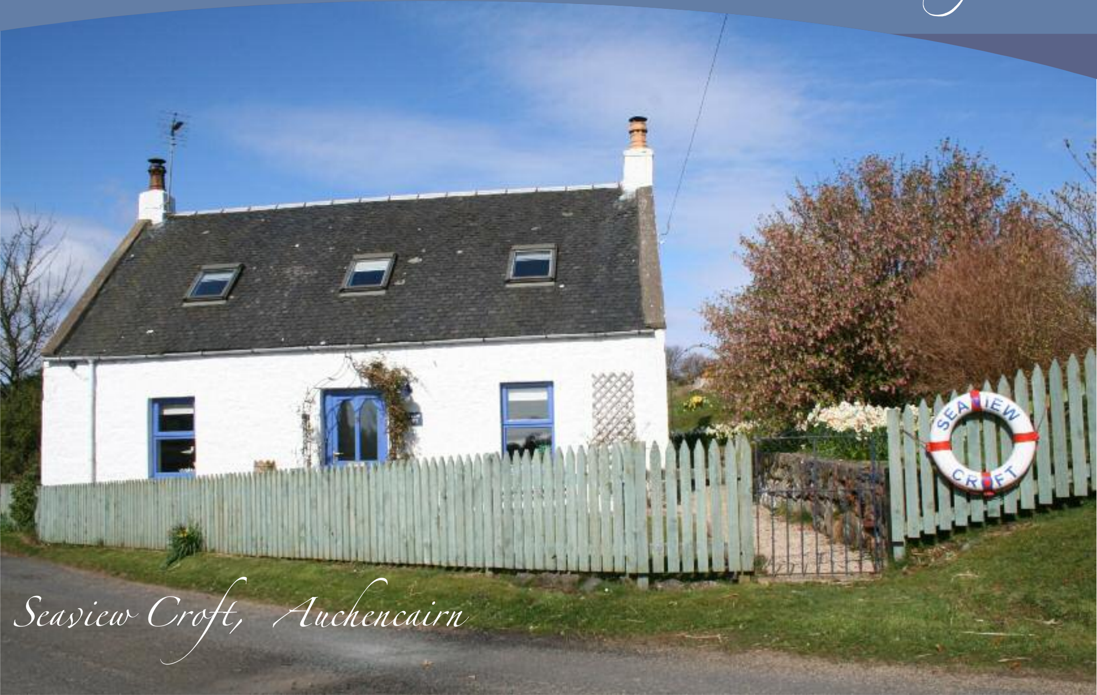
Seaview Croft, Auchencairn