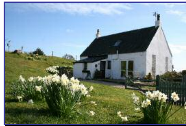
Seaview Croft rear garden