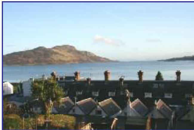
VIEW FROM SUMMERHOUSE

OTHER INFORMATION: 9a Hamilton Terrace is one of the timber framed back house cottages, most of which were built around 80 years ago. The walls have been rendered externally and there is a pitched slated roof with valley gutter linking it to the adjacent property. These popular cottages make excellent holiday homes although most are now used as permanent residences. The property is within a short walk of the local shops, schools and other amenities in this popular village.