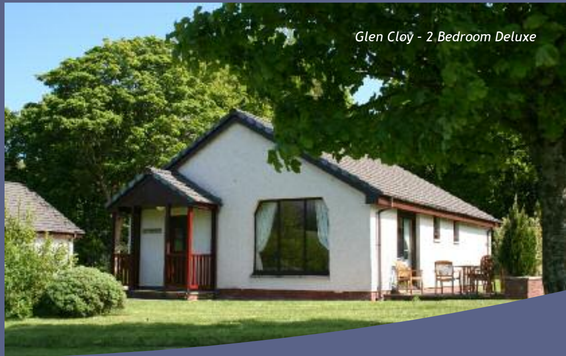
Glen Cloy - 2 Bedroom Deluxe

Arran Estate Agents, Invercloy House, Brodick, Isle of Arran KA27 8AJ