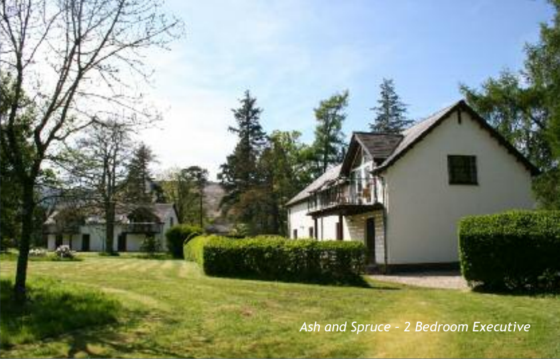
Ash and Spruce - 2 Bedroom Executive