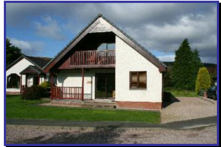
Glen Sannox 3 Bedroom Executive/Deluxe

There is an annual management and reserve fund charge payable. This management fee covers basic maintenance costs for upkeep of the grounds, insurance, council tax, laundry, housekeeping and all day to day running expenses. The reserve fund portion covers major works such as new kitchens, furniture replacement etc.