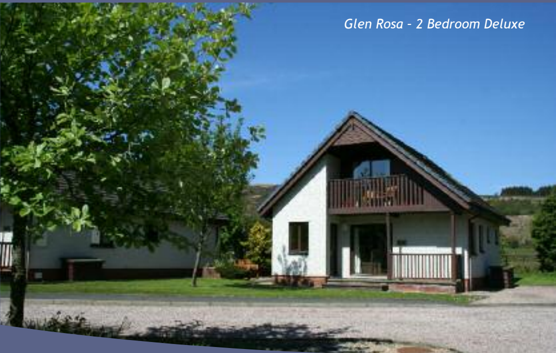
Glen Rosa - 2 Bedroom Deluxe