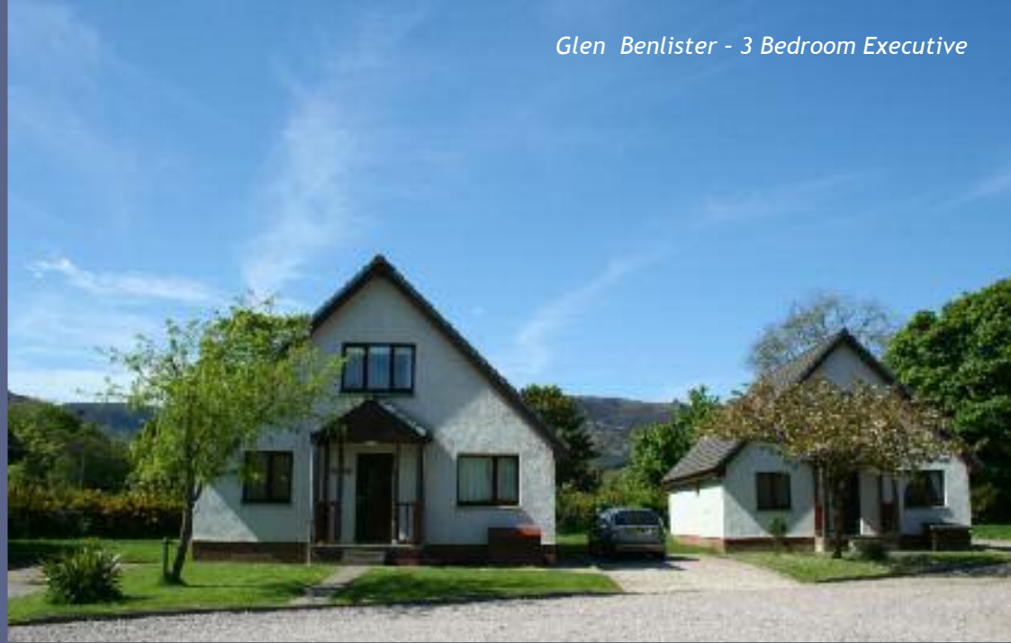
Glen Benlister - 3 Bedroom Executive