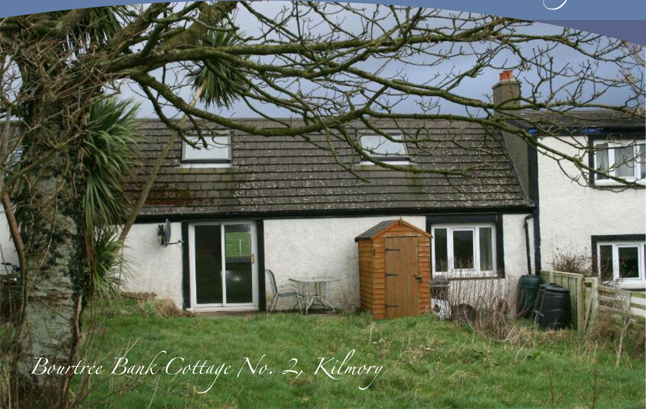
Bourtrees Bank Cottage No. 2, Kilmory