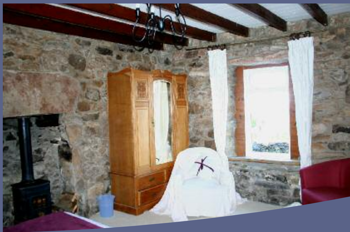
Invercloy House, Brodick, Isle of Arran KA27 8AJ