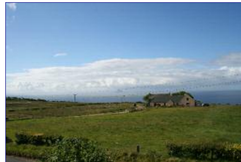
View from Rosebank

Off the main hallway is a large double bedroom with an open fireplace accommodating a free standing solid fuel stove. There is a window to the front and two of the walls are exposed stonework and there is an open beamed ceiling.