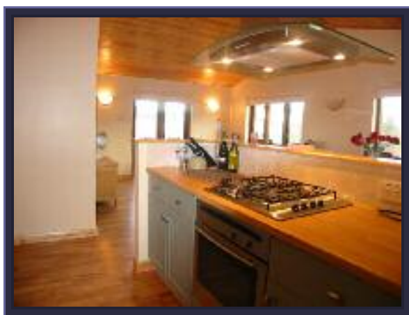
TYPICAL KITCHEN AREA

Accommodation comprises utility room and kitchen which is open plan to the spacious dining room/lounge. There are three bedrooms, one with en-suite shower room plus family bathroom with shower over the specially designed bath.