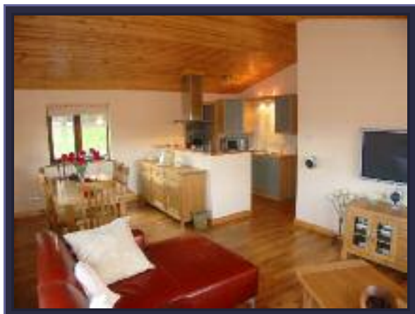
TYPICAL LIVING/DINING AREA

Offered at a fixed price in advance of their completion, the lodges will have excellent views from the veranda across the Shiskine Valley from Blackwaterfoot to the Goat Fell mountains and beyond.